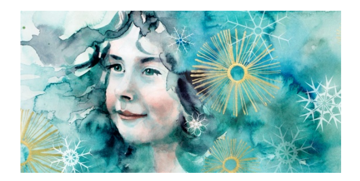
"The events of childhood do not pass but repeat themselves like seasons of the year". - Eleanor Farjeon